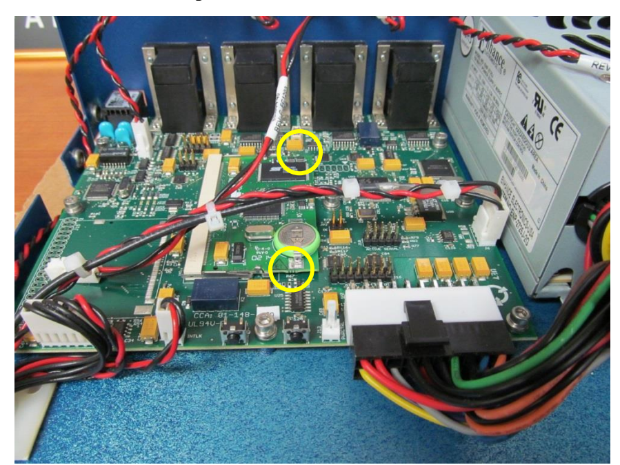
Figure 1: TINI Circuit Board Clip Locations